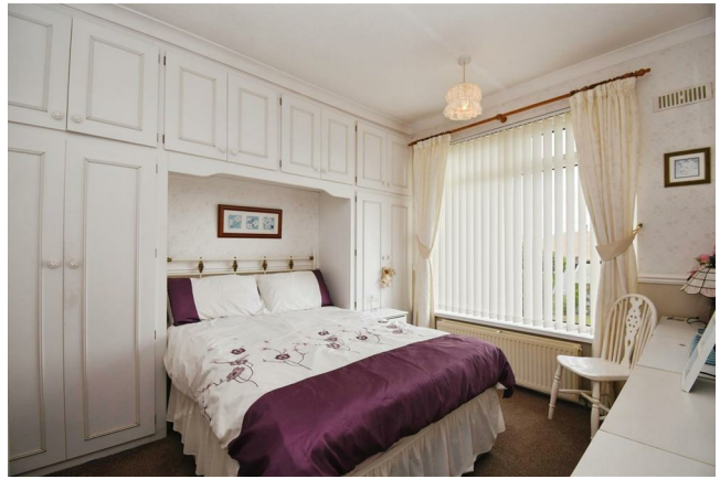
Bedroom two 10'11" x 9'8" (3.33 x 2.95 )

UPVC double glazed window, central heating radiator, fitted wardrobes, and carpeted flooring.