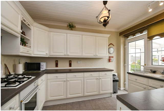
Kitchen 10'10" x 8'11" (3.31 x 2.72 )

UPVC double glazed door to the conservatory, UPVC double glazed window, central heating radiator, tiled flooring, and fitted with a range of floor and eye level units, worktops with splashback tiles above, sink with mixer tap, plumbing for a washing machine, and oven with hob and extractor hood above.