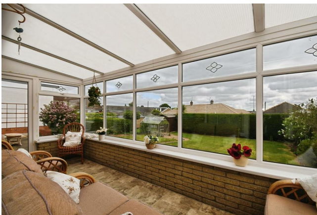
Conservatory 6'3" x 16'11" (1.92 x 5.16 )

UPVC double glazed throughout with door opening to the rear garden, and tiled flooring.