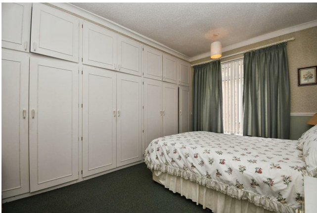
Bedroom one 12'0" x 13'3" (3.66 x 4.04 )

UPVC double glazed window, central heating radiator, fitted wardrobes, and carpeted flooring.